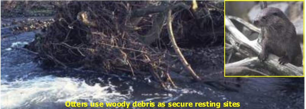
Otters use woody debris as secure resting sites

Insects, birds, amphibians, reptiles and mammals all use CWD and LWD as foraging, resting and lookout sites.