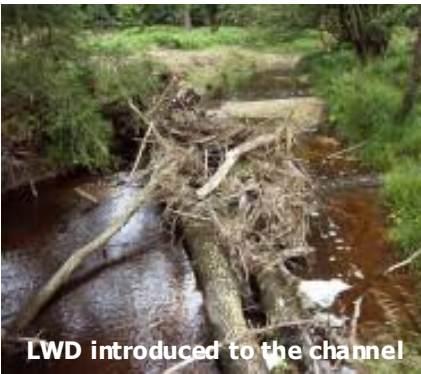
LWD introduced to the channel

Objectives To restore 600 hectares of wetland habitat, in part, by re-connecting watercourses with their former channels. To restore ten kilometres of damaged watercourse.