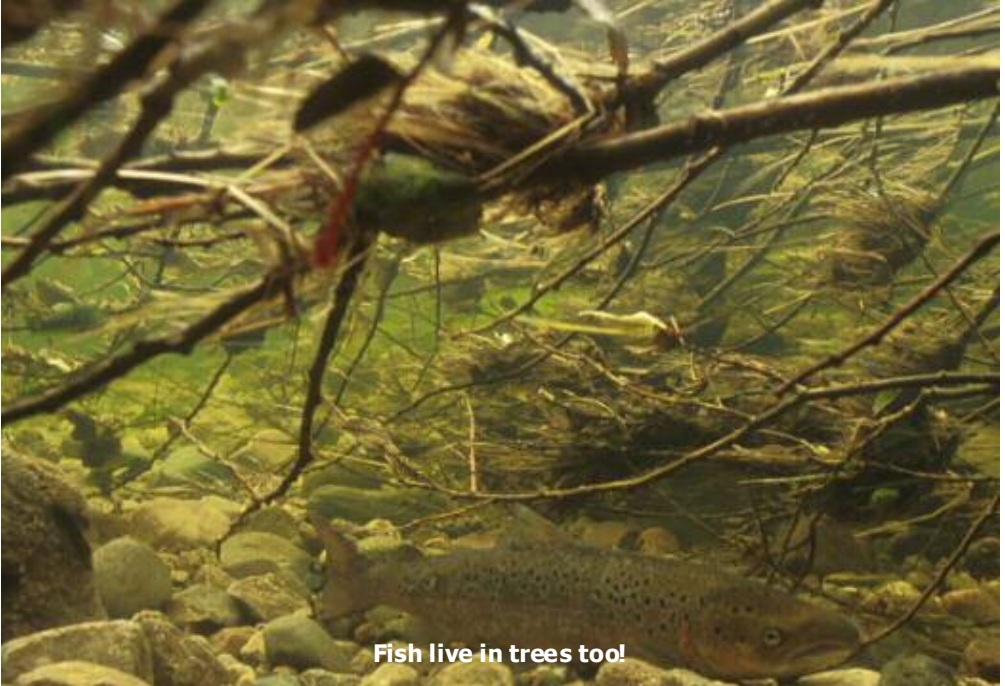
Fish live in trees too!

LWD helps provide shelter from high velocity flows, shade, feeding, spawning and nursery sites, territory markers for migratory fish and refuges from predators. Research in the USA found that pools created by logs and branches provide over 50% of the salmonid spawning and rearing habitats in small streams.