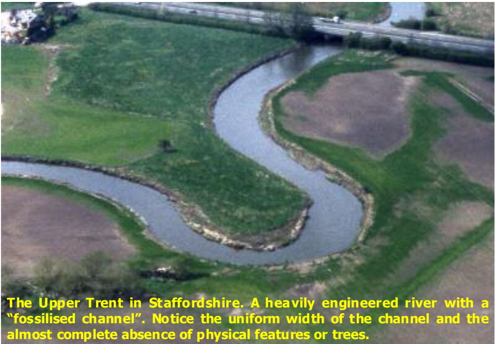
The Upper Trent in Staffordshire. A heavily engineered river with a "fossilised channel". Notice the uniform width of the channel and the almost complete absence of physical features or trees.