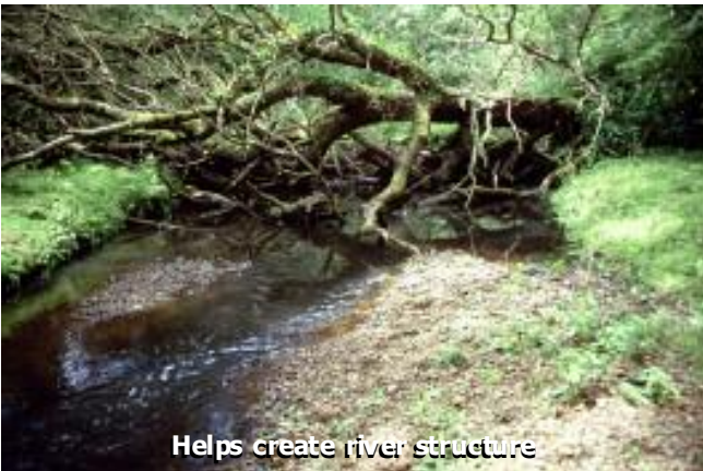
Helps create river structure