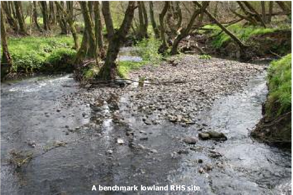
A benchmark lowland RHS site