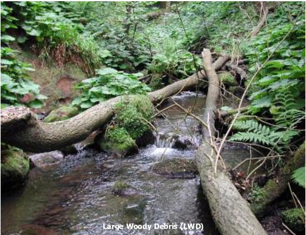
Large Woody Debris (LWD)

Woody debris is a vital component of our watercourses and its removal can severely degrade their health. The positive ecological contribution of LWD has often been overlooked or downplayed, while impacts on water flow and erosion have been misunderstood or exaggerated. This booklet seeks to dispel some of the myths and summarise the latest thinking.