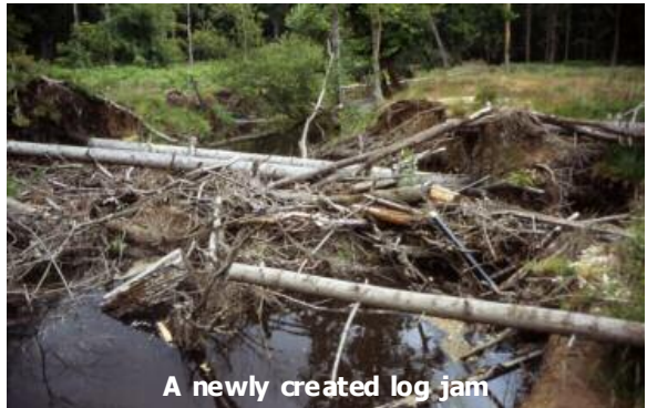
A newly created log jam

Background The New Forest has the highest recorded density of debris dams in Britain. It contains some of the most important and rare wetlands in Europe including spectacular stands of riverine woodland, bog woodland and valley mires. However, many watercourses were re-sectioned and large areas drained for timber growing and livestock grazing.