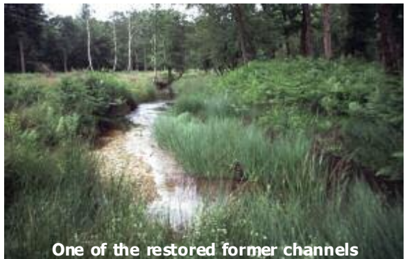
One of the restored former channels