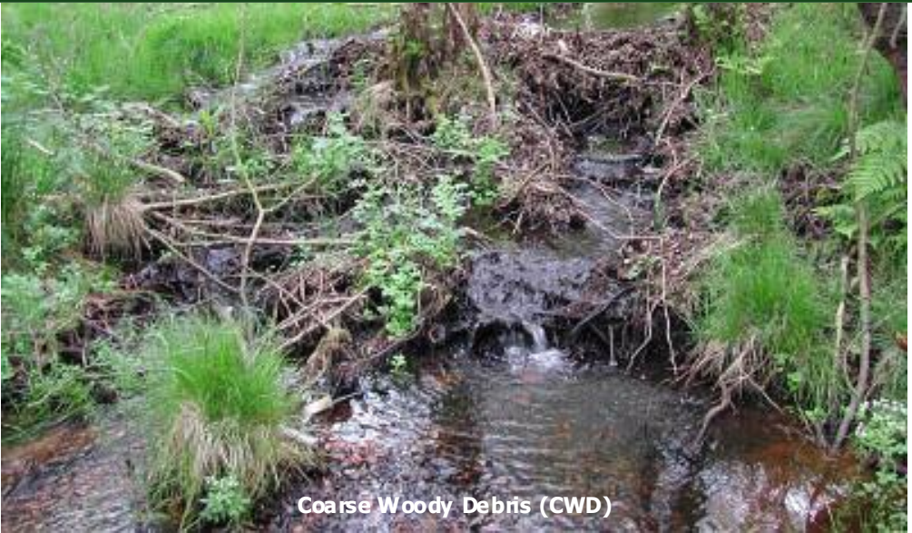
Coarse Woody Debris (CWD)