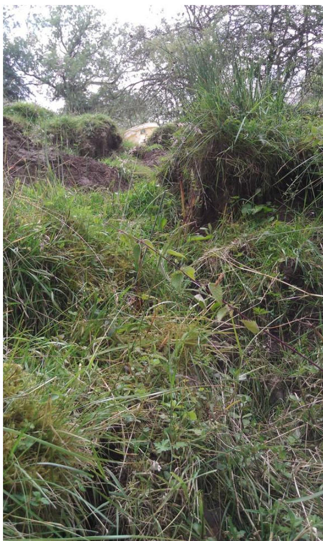
Figure 1.2: Kirksteads Brook – surface water over mud and rocks forming ideal conditions for many species of Diptera.

This site, as previously mentioned is outside the Churnet Valley, but is a useful comparison to the Hudford Brook and the wooded sites as it is on limestone and represents a very different type of headwater stream and associated habitat. This stream is very small, circa 1m wide or less and is probably strongly influenced by the limestone geology. It is also largely open with only small reaches shaded or influenced by bankside scrub.