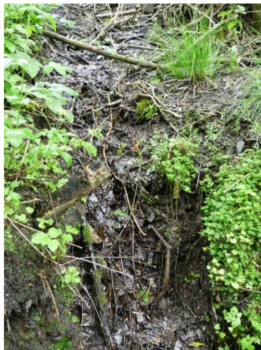
Figure 3.3: Example of a woodland seepage at Foxtwood.

Seepages are a major contributor to species diversity and are the breeding site of many scarce invertebrates, including soldierflies. Other streams in the area also possess these features, for example Ruelow and Bank Lane woods near Froghall where these surface features are very extensive and uninterrupted for much of their course. It is likely, given the frequency and apparent quality of some of these seepages that at least a reasonable assemblage of seepage associated invertebrates is present along the Churnet Valley (A.Jukes, pers obs , 2011).