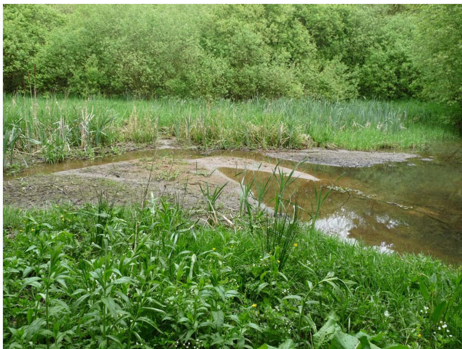
Figure 4.1: Silted area at sample point 3

The Collyhole Brook survey section is relatively undisturbed and as such exhibits a relatively high degree of heterogeneity along its course. There appears to be a reasonable, continuous supply of coarse woody debris for the high fidelity saproxylic species such as Lipsothrix crane flies and Chalcosyrphus eunotus . It is a typical upland, shaded stream course with moderate levels of humidity. The most significant feature of this stream is the silted pool at sample point 3. This is a departure from its natural course, giving rise to an open “glade” where reedbeds and mudflats have developed. This is a very rich Diptera site with an abundance of dolyflies and crane flies utilising the silt for courtship, feeding and breeding.