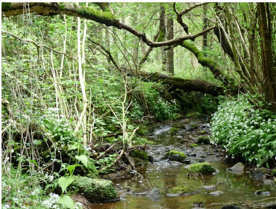
Figure 1.1: Dydon Wood

This woodland is on the eastern edge of the Churnet Valley where the geology changes from carboniferous millstone grit to carboniferous limestone. The woodland is steep-sided producing a valley with high humidity. The stream is narrow with a series of riffles and deep scour pools. The steep-sided valley produces high quantities of fallen deadwood and there are many woody debris dams and physical features within the stream. The stream itself may be influenced by base-rich chemistry from the seepages that give rise to this stream as it starts out on limestone before entering the millstone grit geology and valley proper.