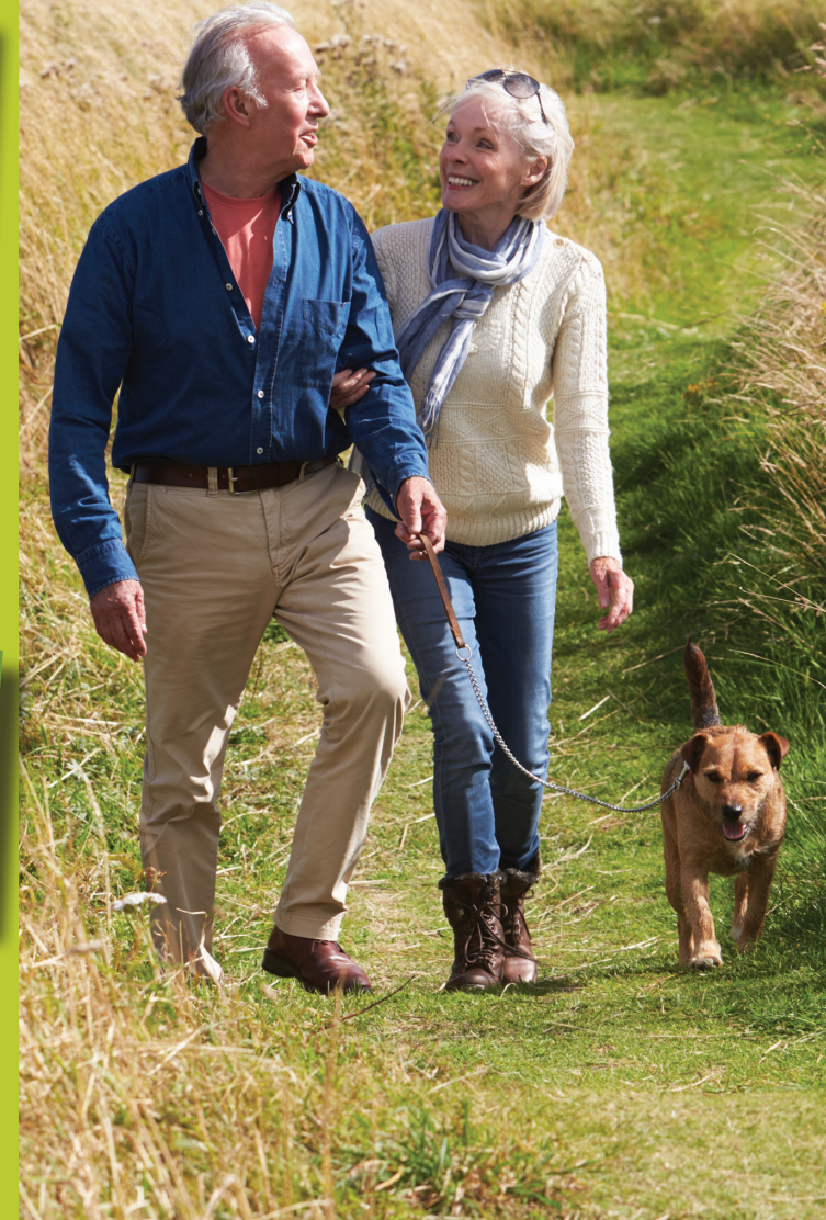
Enjoying and caring for green spaces with your dog